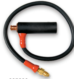
225028 50 mm thread-lock-style for water-cooled torch.