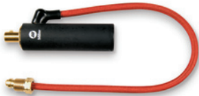
195377 50 mm Dinse-style with water return line for water-cooled torch.