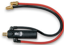
195380 50 mm Dinse-style gas thru with gas and water return lines for water-cooled torch.