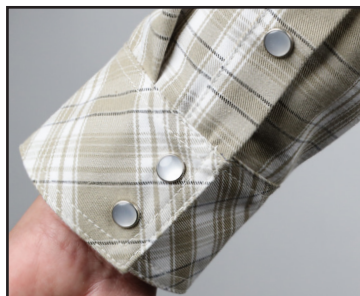
2-SNAP BARREL CUFFS add a distinctly Western flair