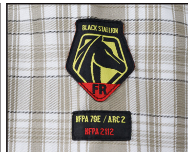
AR/FR COTTON is flame resistant, flash fire resistant, & arc flash hazard resistant

©2025 Revco Industries, Inc. dba Black Stallion Industries, Inc. V01-2025JAN