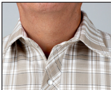
OPEN COLLAR (forward point collar) is the most traditional type of shirt collar