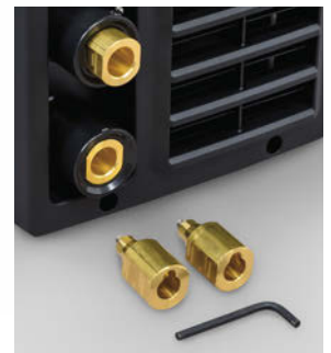
CST 282 with Tweco-style receptacles shown.

Universal connector system allows the machine to be quickly configured to either Tweco®- or Disne-style receptacles. Extra receptacles and wrench shown are sold separately as Universal Connector Kits (see page 4).