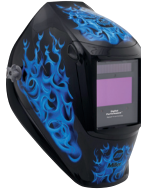
Blue Rage™ 296753