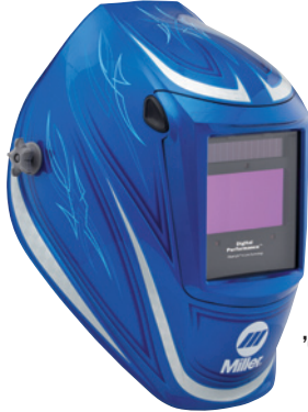
'64 Custom™ 296751