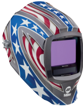
Stars and Stripes™ 296780