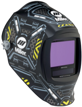
Black Ops™ 296779